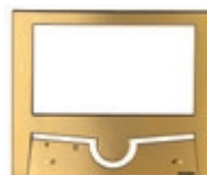
■ 72GD polished gold chrome