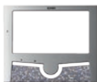
■ 72SC chrome