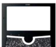
■ 72SB black