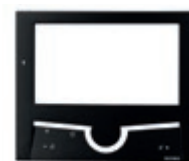
■ 72BK metallic black