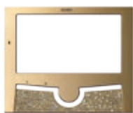
■ 72SG gold