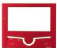
■ 72RD metallic red