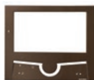
■ 72BZ metallic bronze