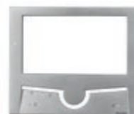
■ 72SV metallic silver