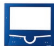
■ 72BL metallic blue