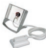
■ 720A white