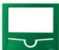
■ 72GN metallic green